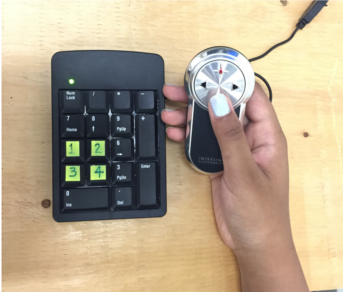
Figure 2. Mouse used for calibration and numeric keypad from which participants selected their response.

hierarchical regressions used the BIS-11 subscales (attention, motor, and nonplanning) to predict PPVT-IV performance (i.e., standard score and percentage of correct responses). Potentially influential demographic information was controlled for in the first step of the regression.